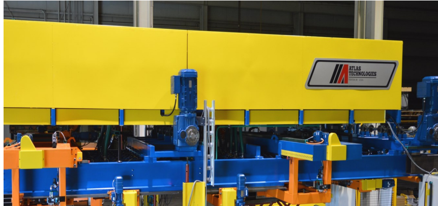
Mezzanine walls with sound barrier rails enclose pressure blowers.